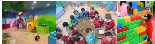
Figure (10) some kindergartens create an opportunity for children but just in indoors. [20]

As you see in figure 10, some kindergartens considered these criteria partly. They have been designed Some spaces for sand play, blocks, private spaces and different imitative games and also spaces for challenging, but most of them were indoors.