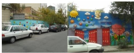
Figure (5) most of the kindergartens have been located beside wide and crowded streets. [20]

The City of Vancouver recommends an outdoor space ratio of 10.6 m 2 -14m 2 per child for ages three to five years enrolled in full time group child care. Based on our findings centers with 14m 2 per child ratios or slightly higher offered more flexible space for early childhood educators to improvise different play activities, and extra space also allowed for more gross motor activities like running.