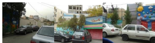
Figure (11) no consideration to neighbors and commuting beside kindergartens. [20]

As you see in figure 11, many kindergartens have been designed not regarding this important criterion especially the buildings have been located in south of the street. Children are not safe while they are exiting the kindergarten. They directly enter the street that leads to big dangers.