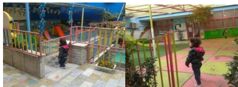
Figure (7) the connections have been designed very unprofessionally.[20]

There is no space for cycling and even running for children in our case studies. These spaces have been separated by fences and there is just a window with thick curtains to prevent visual communication. The paths have been separated by stairs which are not standard in height. Since the most kindergartens were often houses where have not been designed specifically and just by adding some details have been changed to child care centers, the connections are usually contrary to standards for children and it has been done in form of stairs. So, due to lack of play space and overcrowding and to maintain the safety of children, most of the time, they are prevented even from running. These kinds of connection between the spaces not only discourage the children to play outdoors but also prevent them from playing. There are some examples in figure 7.