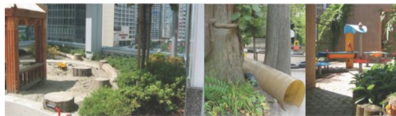
Figure (3) the unique character of a place. Vancouver, Canada.[2]

Character refers to the overall feel and design intent of your outdoor play space. We have identified four architectural character types currently existing in our study: modern, organic, modular, and re-use. These physical characteristics have been successfully used in European studies of child care environments and they provide an effective way to code for design type. These three images in figure 3 show how play spaces can be designed to reflect the unique character of a place contribute to the overall feeling of a play space and differentiate one play environment from another.