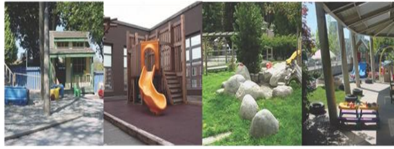
Figure (2) Views of four different outdoor play spaces in our study.[2]