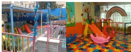
Figure (4) there is not a clear space between the outdoor and the indoor play spaces. [20]

As you see in figure 4, our case studies considered this criterion partly but the outdoor play spaces included a courtyard full of paintings and play equipment. This equipment also existed indoors and in some cases, there was even a roof over the equipment outdoors which made it similar to indoors. The outdoor play spaces have never been considered and designed as an important factor to reflect the unique character but they have just been decorated.