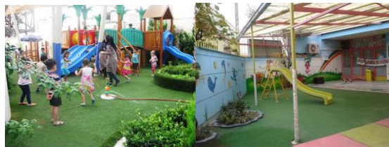
Figure (9) some kindergartens considered changing outdoor play spaces according to events and coming different seasons.[20]

- described what they were experiencing to each other and to their early childhood educators. This verbal venting is one of the first steps to literacy, and should not be overlooked when considering whether plants should be part of the play space. Plants not only modify the climatic conditions and provide light shade, but the flowers, seeds, and leaves produced by this living material can provide open-ended play props for children. Vegetation supplies a wide variety of play resources that children can harvest for themselves.