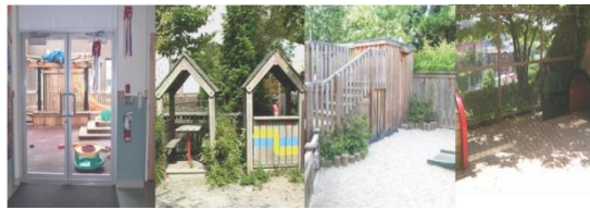
Figure (6) connectivity's between spaces. Vancouver, Canada.[2]

third one, his fence connects the toddler and 3-5 play spaces. The spaces in the fence allow children to interact and observe each other. And the last one, this child scaled tunnels are a unique design solution to improve the connectivity of a play environment.