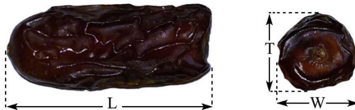
Figure 3: determining dimensions of dates

The mass of dates was measured using a digital scale (MH-200, CHINA) with precision of 0.01g. The mass of different varieties of date seed was also determined with the same method. In order to determine the ratio of the mass of date seed to the mass of total dates, first the mass of full seeds as well as the mass of seed of all of them were measured, and then equation (5) was used for this purpose where m is considered as the mass of date seed in terms of g, M as the mass of full dates in terms of g and R as the ratio of seed to the mass of full fruit of dates in terms of percentage.