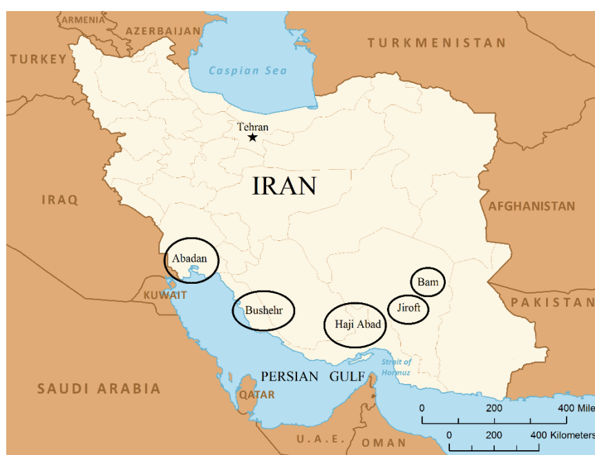
Figure 2: production regions of studied varieties in this research

After the removal of defective samples, the study was done on the nutritional and physical characteristics of the samples. The wet-basis moisture content of samples was determined using the inclusion of 10 grams of samples in an oven with a temperature of 103 \pm 3 °C until reaching constant weight and in accordance with the standard and using equation (1) [30].