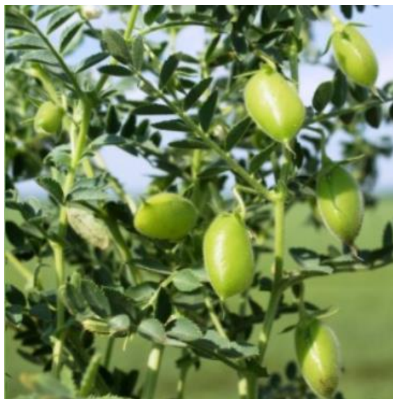
Figure 1. Chickpea

In terms of mineral composition, chickpea seeds contain a lot of phosphorus, calcium, potassium and magnesium. The magnesium normalizes the pressure and is essential for muscle function. Calcium helps maintain healthy bones, teeth and heart muscles. The chickpea ranks first among legume crops in terms of selenium content, which is involved in regulating the permeability and stability of cell membranes, by incorporating it into cellular structures. Tocopherols, carotenoids and sulfur-containing amino acids contained in grains of chickpea increase the anticarcinogenic activity of selenium [7, 8].